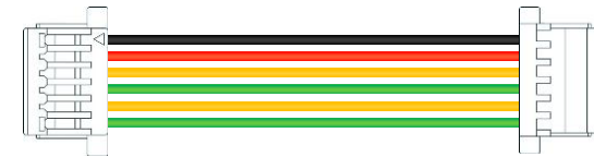
JST-SH 6-pin 195mm Cable x 1