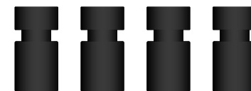
M3*8mm Silicone Grommet x 4