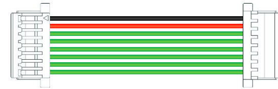
JST-SH 8-pin 35mm Cable x 2